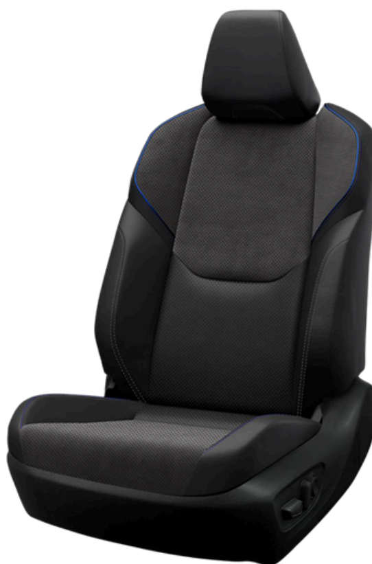
Partial Leather and Ultrasuede with Blue Stitching (Sport and Sport Launch Edition) (FA20)