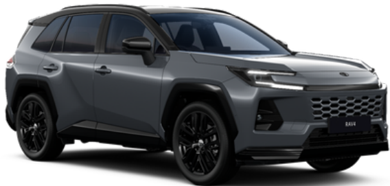
Massive Grey Bi-tone (M22)**