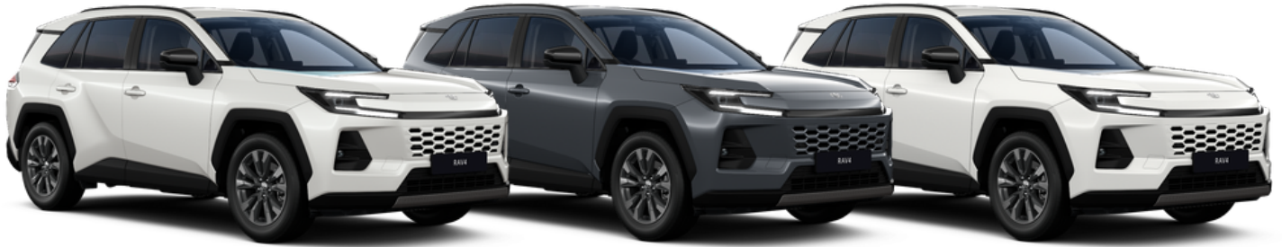
Pure White (040)*