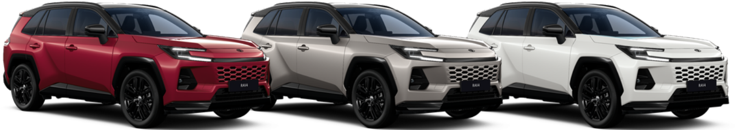
Tokyo Red Bi-tone (2NF)***

BITONE (Sport and Sport Launch Edition only)