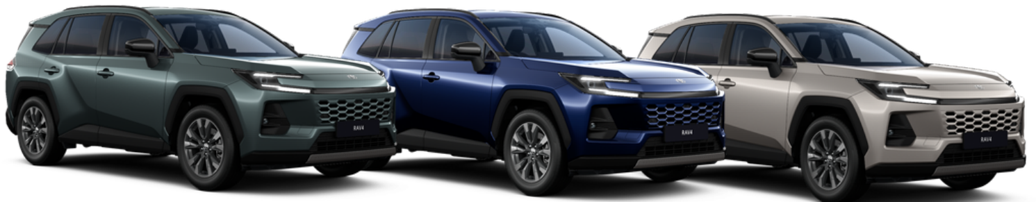
Forest Green (6X7)**