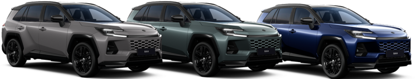
Urban Rock Bi-tone (M38)**