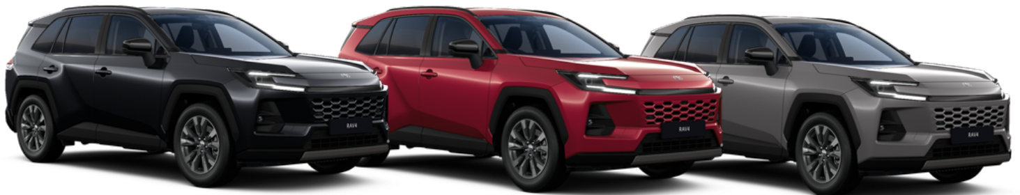
Attitude Black (218)**