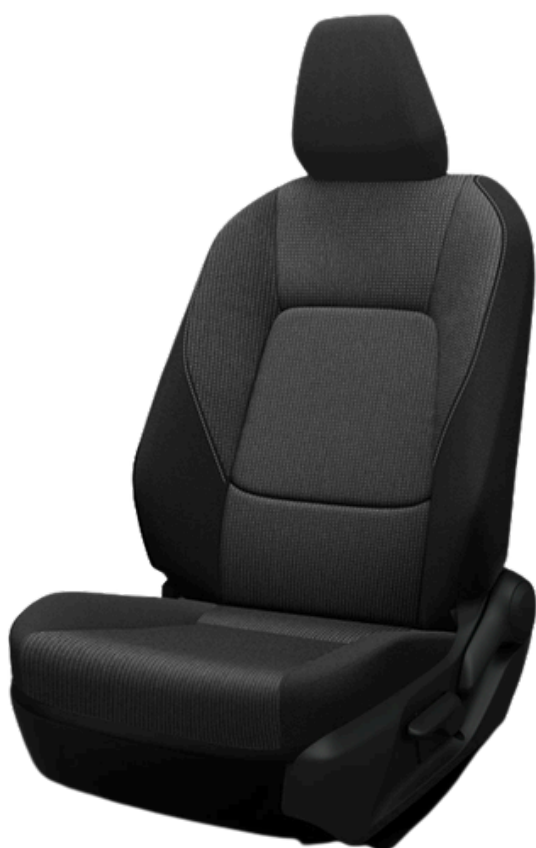
Black Fabric (Sol) (EC20)

Available in black fabric or synthetic leather & ultrasuede. All grades feature a unified black instrument panel, delivering a fresh and modern look.